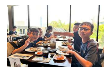
Enjoying a lunch buffet break at a hotel in Wan Chai, where we recharged with delicious food and shared stories from our day's exciting challenges.

Gathering for a group photo at the Peak, showcasing our team's spirit and excitement before a thrilling day of adventure.