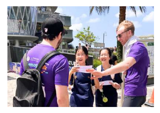
Taking a photo with international visitors after conducting interviews, capturing the essence of cultural exchange and shared experiences.